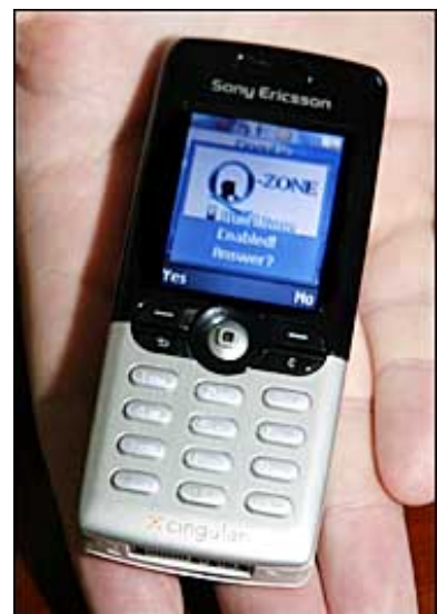
A phone silenced with a system from BlueInX.

Special Offer: Home Delivery of The Times from $2.90/week.