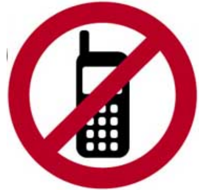
Stefan Sagmeister and Jan Wilker

Cell Block's products are slightly more sophisticated versions of what is probably the most widespread method of stopping cellphone use, called jamming, which renders phones inoperable by disrupting the connection between cellphone towers and cellphones. Jamming devices overpower phones' frequencies with especially strong signals and often with loud noise. Such