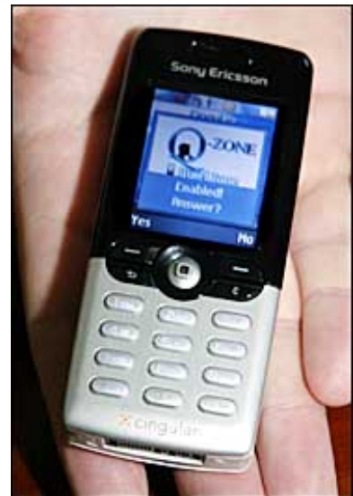
A phone silenced with a system from Bluelinx.

Home Delivery of The Times from $2.90/week - Act Now!