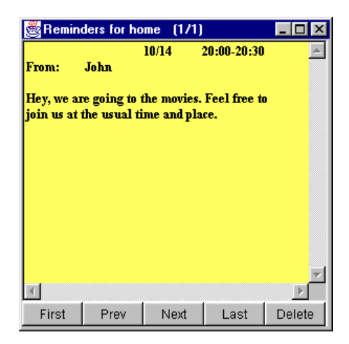
Figure 6: Visual interface component to view and scan reminders

Context-aware reminders for comMotion mobile users can be sent via the regular email system by specifying the location name in the subject line. This is important since the mobile user must be accessible to the rest of the world. Reminders, or electronic Post-it notes, can also be sent from another comMotion client, however, unlike the todo items, they are text-only.