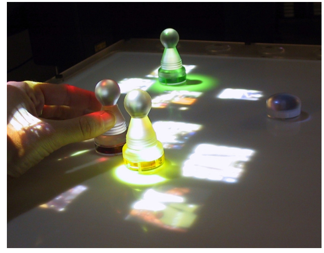
Figure 1. The graspable objects in Tangible Viewpoints.

In PDC 02 Proceedings of the Participatory Design Conference, T.Binder, J.Gregory, I.Wagner (Eds.) Malmö, Sweden, 23-25 June 2002. CPSR, P.O. Box 717, Palo Alto, CA 94302 cpsr@cpsr.org ISBN 0-9667818-2-1.