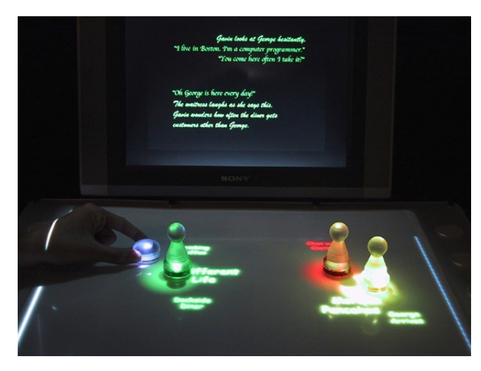
Figure 3. User interacting with The Diner story.

text), and as such can present character development, action and location with as much complexity as any scene of a film or chapter of a book. An aura is projected around each pawn to give a visual representation of the prominence of its character's viewpoint in the current telling of the story. Changes in the story space (i.e. when the story moves forward or there is a shift in character perspective) are reflected by dynamic changes in the projected graphics.