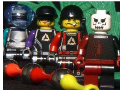
Tricked into taking a good picture (Image: Ankit Mohan/Douglas Lanman/Shinsaku Hiura/Ramesh Raskar)