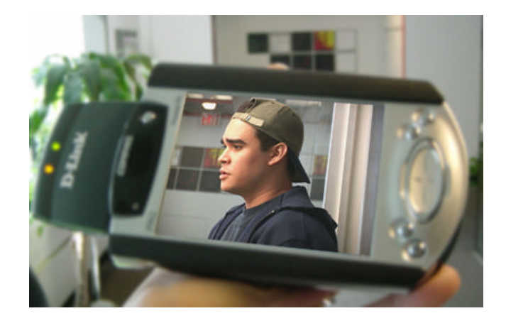
Figure 1: A mobile cinematic story

The resulting M-Views experience takes the user on a journey through the physical world, and pieces of the story—in the form of media clips—appear on the handheld at different locations. The selection, order, and timing of these clips are all unique; each person will experience the story in a different way, because with every movement, s/he affects its outcome. We call this interactive experience Mobile Cinema .