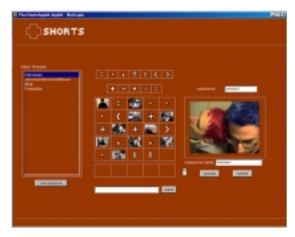
Figure 1: PlusShorts Interface

Users can browse through and select sequences to play using a newsgroup-style interface. Here, the user loads a video sequence into the storyboard area by selecting a specific sequence post within the hierarchical tree of video threads, which can be sorted by date, author or thread category.